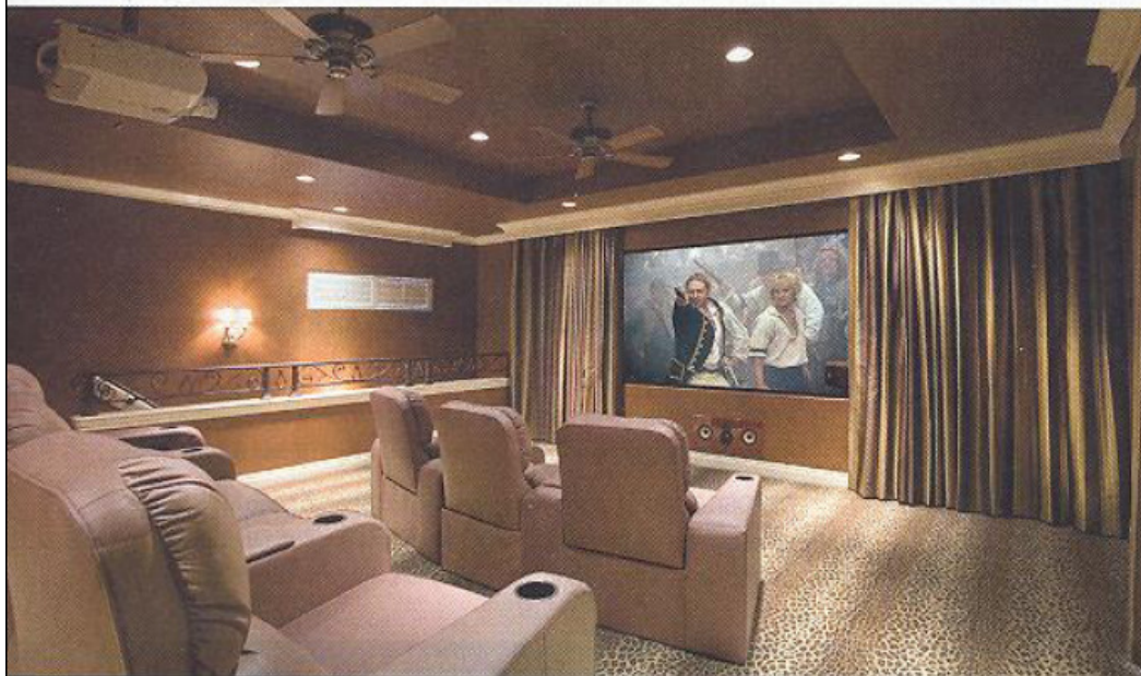
TOP According to Charissa Seipp of Charissa Seipp Interiors, color has been incorporated into everything as well as metallics.